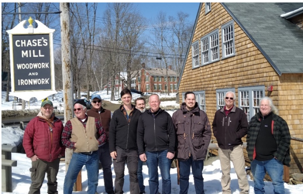
Timber Framers Guild from Sweden