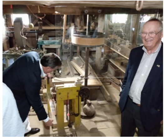
Members of Timken Foundation Touring the Mill

Timken awarded Chase's Mill $52,362 back in 2020 to restore old machinery, furnish the community room, reclaim Lake Edith, and match the Northeast Heritage Economy Program grant.