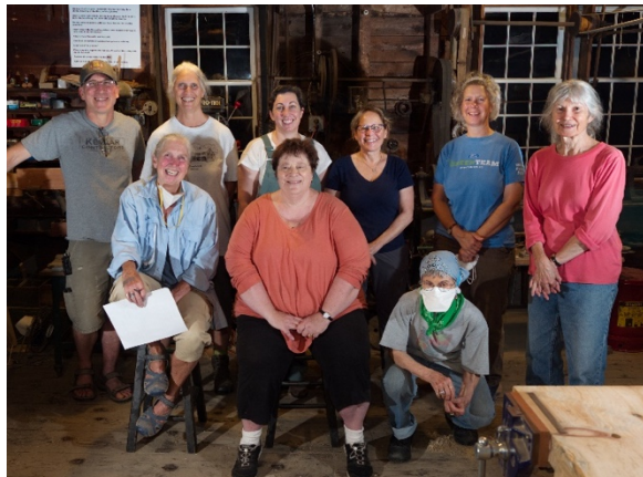
Women's Woodworking Class

The Women's Woodworking class offered both skill building and improvements to the Mill such as a bookcase, built-in storage for tables, and closing in the knee wall in the Community Room.